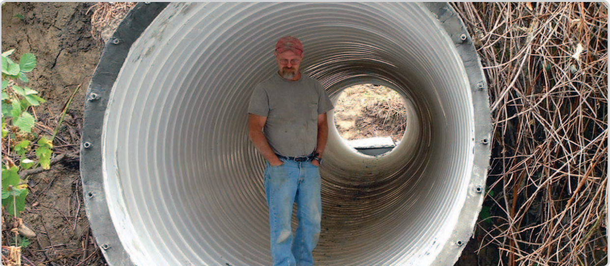
The Danby System eliminates the need for costly and disruptive "dig and replace" methods in many applications.

Standard Specification for Poly (Vinyl Chloride) (PVC) Profile Strip for PVC Liners for Rehabilitation of Existing Man-Entry Sewers and Conduits