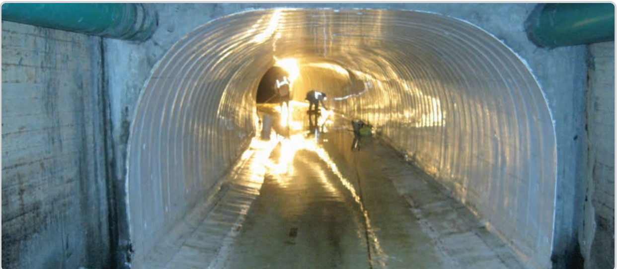
The versatility of The Danby System allow it to be tailored to address extremely unique shapes and project requirements.